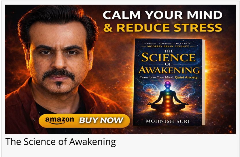
The Science of Awakening